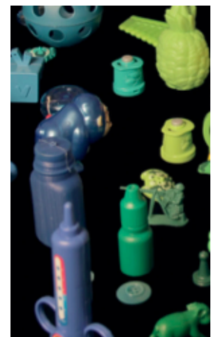
Still from The Five Minute Museum (2015)